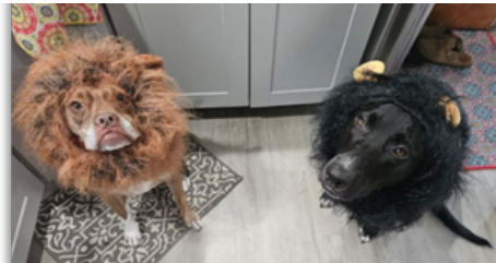
Gretzky and Crosby dressed up in their Halloween costumes (Meg McCreight)