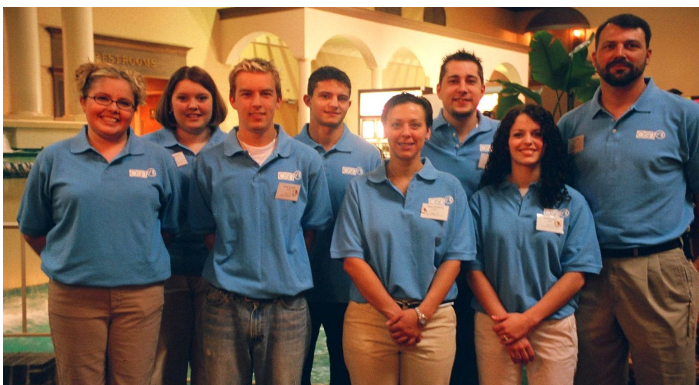
2005 FIRST OSRT Student Intern Group