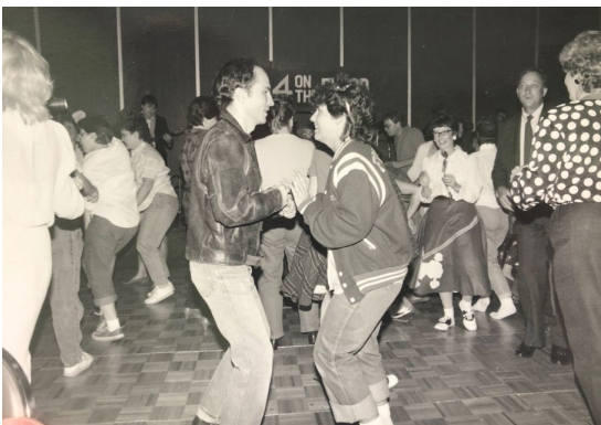
1987 Annual Meeting "Sock Hop"