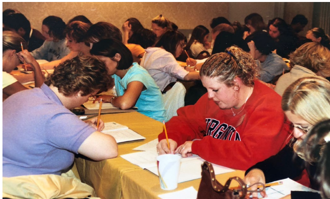
2003 Student Self- Assessment Exam