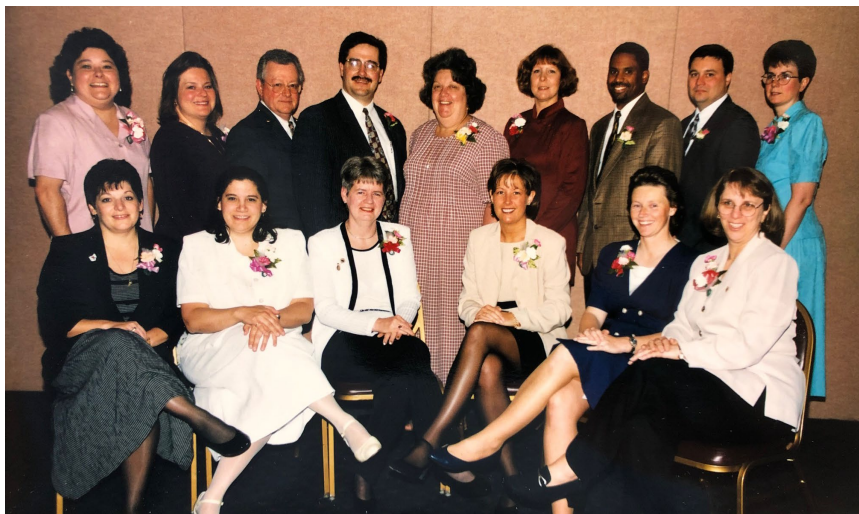
1999 Board of Trustees